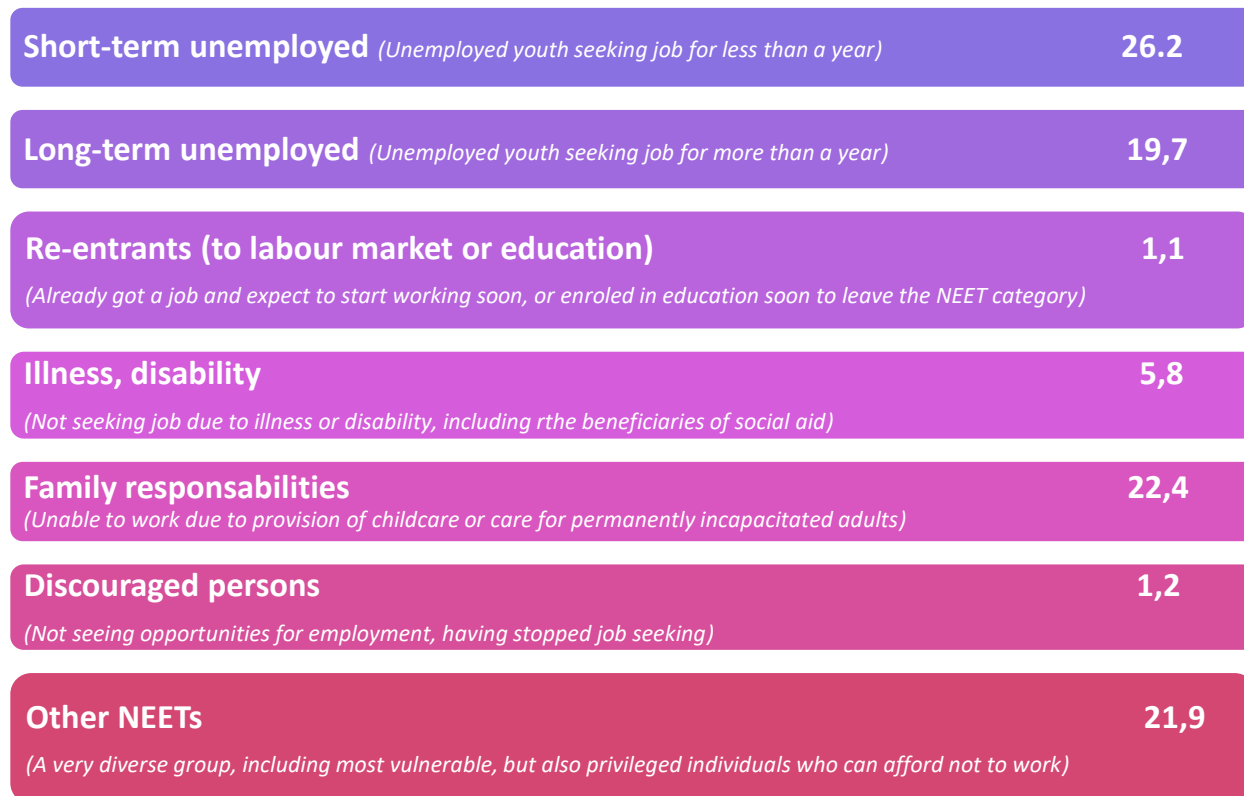
Chart 1. NEET youth in the RS by subgroups, 2020

In 2020, over 26% of young people were short-term unemployed, while 19.7% were unemployed for more than one year. Among inactive NEET youth, those who are separated from the labour market due to care for others and family responsibilities (22.4% of the total NEET population) and for others, undetermined reasons (21.9%) prevail. Young people who are not engaged in the labour market due to illness or disability accounted for 5.8% of the total (13,100) in 2020.